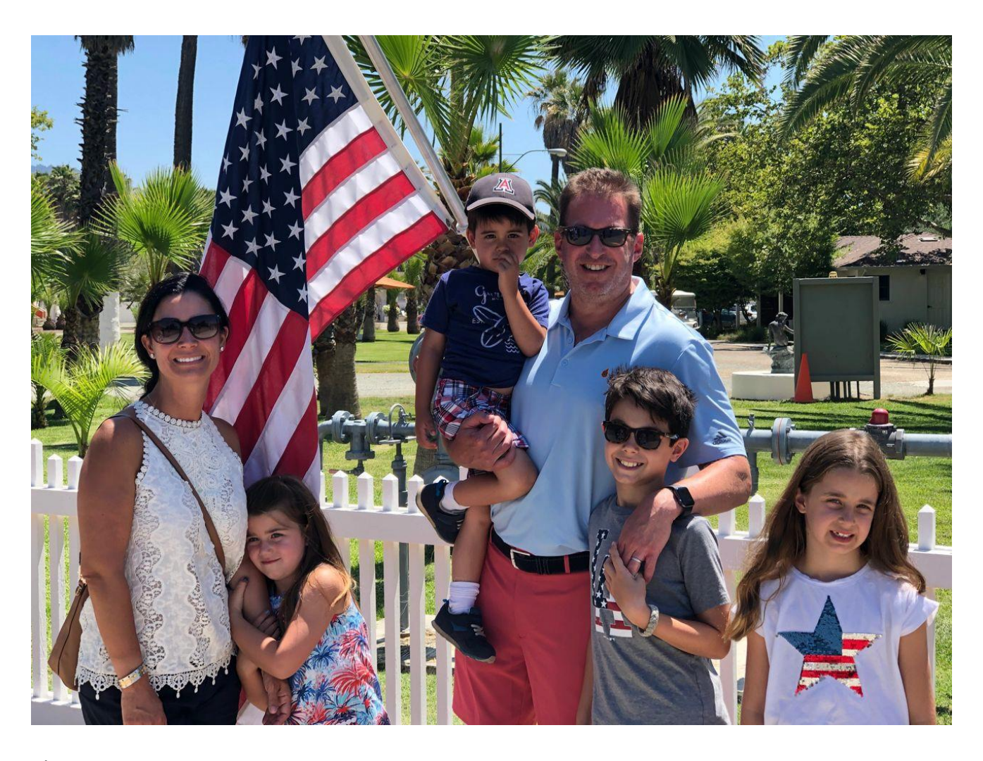
The BEST winery to visit in Sonoma County!